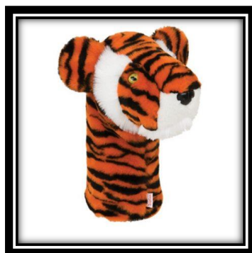
Tiger Golf Club Cover

The 3 rd place winner will receive the remaining prize.