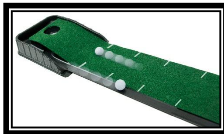
Putting Mat with Ball Return