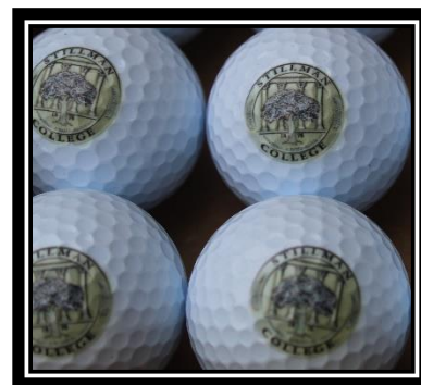
Stillman College Logo Golf Balls (12 total)